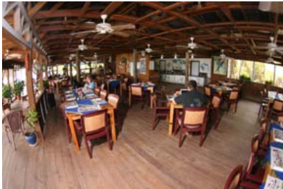
CocoView's dining room doubles as access port to the outside world with the free wireless web accesses.

This was our first visit to Roatan and we were a bit apprehensive after reading and hearing about the effects of over development on the island. After spending a week at Cocoview Resort, our concerns were put to rest, at least for this small part of the island. The coral in Roatan was not in as good of condition or as large as what we saw in Guanaja. The size and diversity of fish we saw in Roatan was more than what we saw in Guanaja. The week we were there, we were treated with an unexpected bonus; the annual fish count sponsored by ReefNet Inc. and Cocoview Resort was taking place. We took some time to do two activities off the resort and enjoyed both very much. All considered, we would go back to and recommend Cocoview Resort in Roatan.