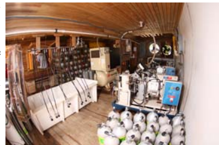
CocoView's compressor room keeps full tanks available for all divers.

The morning's orientation was thorough and well attended by all new visitors, as well as a surprising number of people who had been to the resort many times. The dive operations were efficient but confusing in the beginning because of so many resort procedures. For example: masking tape on the locker shows you want nitrox, a wooden paddle hung on a nail means you plan to participate in the boat dives, and a flashing beacon light missing from the dive board means someone is in the water for a night dive. Once we figured these things out, it was great! Because of the masking tape, there were always fresh nitrox tanks in our locker ready for us to analyze and use. Because of the wooden paddle, our dive gear was automatically loaded on to the boat with two tanks for both the morning and the afternoon trips. We were able to dive sites such as Iron Shore, The Wreck of the Prince Albert, Newman's Wall, CoCo View Wall, Castle Canyon, The Wreck of Mr. Bud, John's Spot, Big French Cay Cut, Missing Link, Valley of the Kings, and Forty Foot Point. We did not even have to leave the resort to find numerous species of fish in the "frontyard". We found nudibranchs, corallimorphs, a huge variety of blenny, sea horses, octopus, balloon fish and large groupers. The one disappointment was that the boats didn't venture far from the resort and the second dive of each boat trip was always a drop off within swimming distance of the resort.