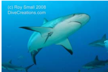
Close encounters with at least 16 Caribbean reef sharks during the shark adventure dive.

We did take time for two activities off the resort. The first was Pirates of the Caribbean Extreme Canopy Tour which consisted of 8 high strength cables strung across a valley and through the trees, the highest being about 300 feet above the valley floor. The toughest part of “zip-lining” was the first jump! Once you are attached to the cable with a pulley and harness, you have to step off a platform and launch yourself into the air, letting gravity do the rest of the work. The second was a Shark Dive with Waihuka Adventure Diving. Before the dive, we all assumed we would be kept a ‘safe distance’ from the sharks, but during the dive briefing, it became clear to us that ‘safe